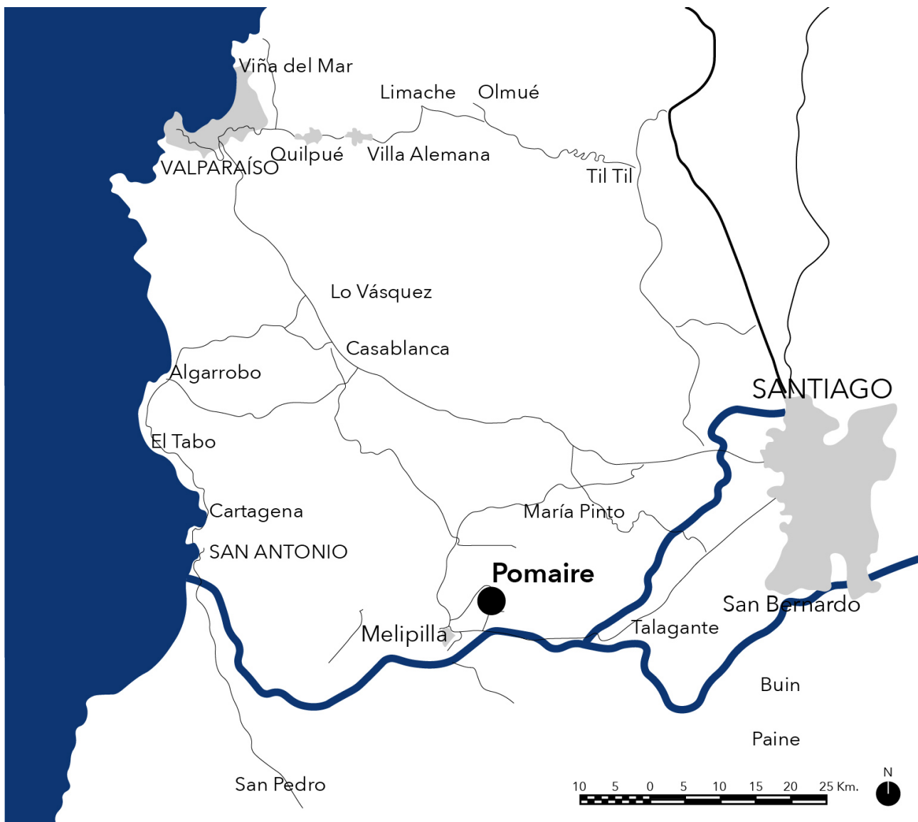
Figure 1. Map of Pomaire. The village is located close to Melipilla, between the capital city of Santiago de Chile and the international port of San Antonio.

On the other hand, a design-based investigation led by the second author between 2017 and 2020 look into growing vulnerabilities observed in the Global South craft sectors (even in business models based on social and solidarity values, such as Fair Trade) due to their extreme dependency on distant markets 37 . It examines the case of women weavers from the Guatemaltecan cooperative Aj Quen located in Chimaltenango, Guatemala, which was founded in 1989, when Fair Trade represented an economic alternative towards development through the access to the international market 38 . Its core business is the production of local textile handicrafts commercialised through long-standing fair and international solidarity trade partnerships with many members of the European Fair Trade Association (EFTA). While in 2017, 80% of Aj Quen's revenue still came from the international Fair Trade market, the craft orders from the European Fair Trade sector strongly declined in recent years. Therefore, as the dependency on the external market interferes in the autonomy of this craft community, the viability of this economic model is called into question. In this context, the co-design research aimed to find joint solutions starting from their local environment and their craft values.