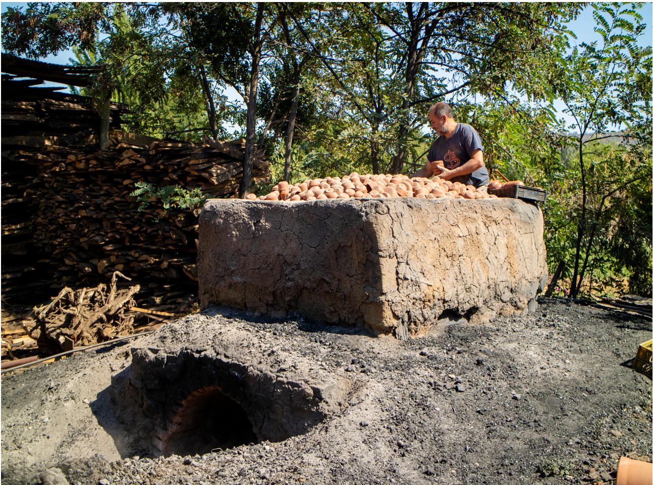
Figure 3. The use of wood-fired kilns prevails in Pomaire, despite various initiatives to replace them with gas kilns. The artisans favour their autonomy to acquire and manage the fuel.

The case of the women weavers from Guatemala is quite different from the one of Pomaire but serves to interrogate the notion of autonomy as a fundamental value of relationality, enabling artisans to be sovereign in governance and united in resilience.