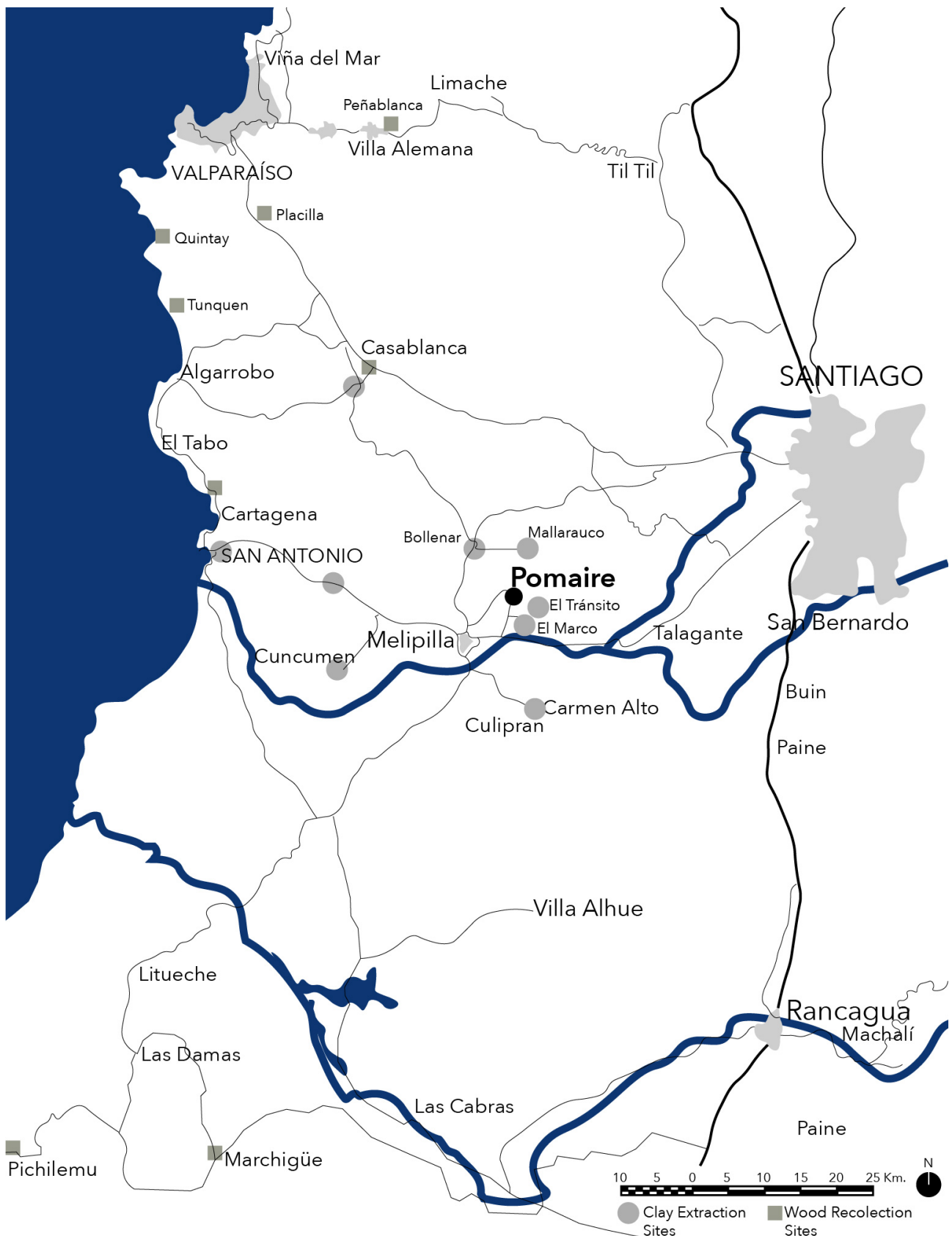
Figure 5. Map of the extraction sites for pottery production in Pomaire. Nowadays, the clay is no longer extracted in the village of Pomaire but collected between Pomaire and the coastal regions of San Antonio and Valparaíso. The wood for the kilns is obtained between 100 km north and 150 km south of the village.

The case studies in this article contribute to highlight how the constant search for materials provides insights into the resilience of the crafts' production chains and practices, the conception of