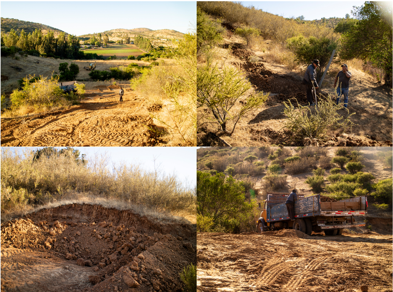
Figure 4. Sequence of images of two artisans from Pomaire searching and extracting materials from a clay pit. The craftsmen recognise the location of the clay source based on their previous experiences on the territory. When they identify the clay pit, they initiate the negotiation with the private lands owners to start extracting material.

This phenomenon appears in the current search of artisans for new sites for material supply far from the village of Pomaire due to the loss of the traditional common places for extraction. The extraction sites around the village have turned inaccessible, reserved for agriculture or urban infrastructure, so the artisans need to search for new clay pits in the surrounding areas permanently, where they pay to extract the material. Another example of material conflict is in the pottery community of Quinchamalí and Santa Cruz de Cuca, in Chile, where accessible spaces for clay extraction are being blocked and planted with monocultures of pine and eucalyptus, threatening the traditional pottery-making of the area. This menace led to the search for protection of the resources through a nomination for safeguarding the immaterial cultural heritage presented to Unesco, to generate an action against the cultural and ecological impact of monocultures in the area 54 .