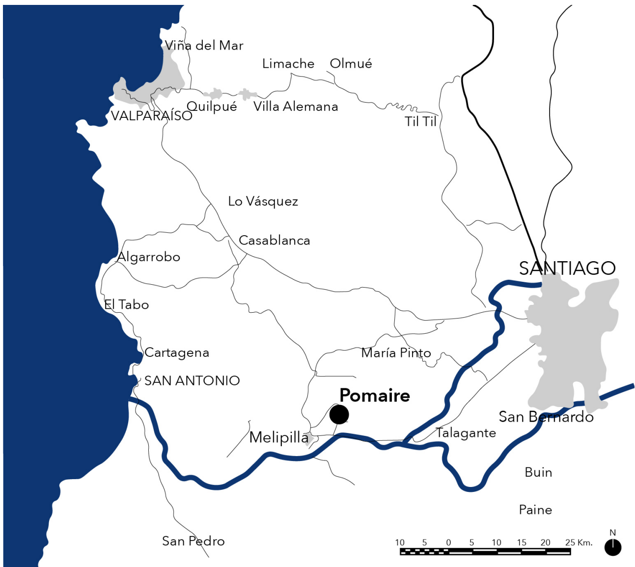
Figure 1. Map of Pomaire. The village is located close to Melipilla, between the capital city of Santiago de Chile and the international port of San Antonio.

On the other hand, a design-based investigation led by the second author between 2017 and 2020 look into growing vulnerabilities observed in the Global South craft sectors (even in business models based on social and solidarity values, such as Fair Trade) due to their extreme dependency on distant markets 37 . It examines the case of women weavers from the Guatemaltecan cooperative Aj Quen located in Chimaltenango, Guatemala, which was founded in 1989, when Fair Trade represented an economic alternative towards development through the access to the international market 38 . Its core business is the production of local textile handicrafts commercialised through long-standing fair and international solidarity trade partnerships with many members of the European Fair Trade Association (EFTA). While in 2017, 80% of Aj Quen's revenue still came from the international Fair Trade market, the craft orders from the European Fair Trade sector strongly declined in recent years. Therefore, as the dependency on the external market interferes in the autonomy of this craft community, the viability of this economic model is called into question. In this context, the co-design research aimed to find joint solutions starting from their local environment and their craft values.