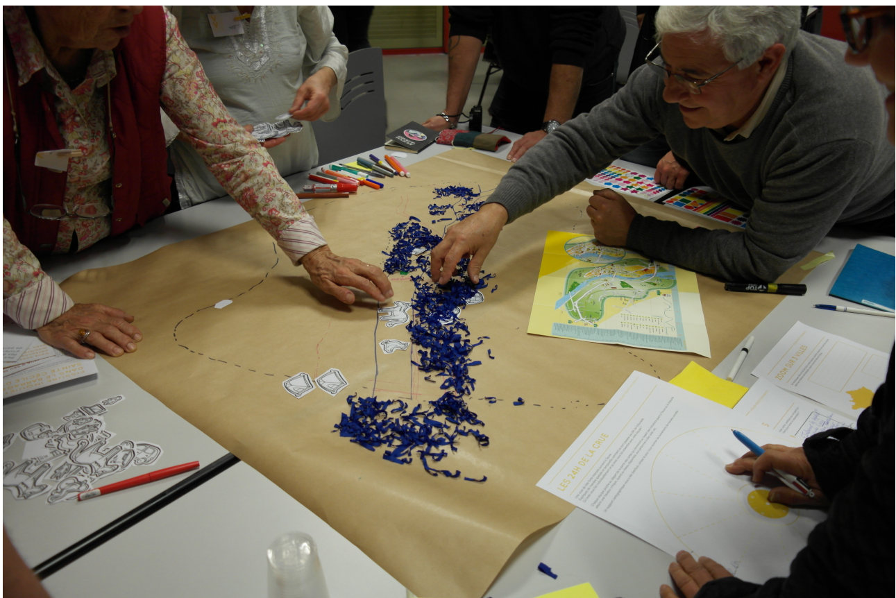
Figure 6. 24-hour flood

During the workshop, the activities offered to participants were divided into two phases. During the first phase, entitled Sauve in 2030 , participants were shown five fictional newspaper articles. These were about a disaster supposed to occur in 2030 in the Gard département , inspired by the main topics highlighted in the interviews: weather forecasting, dam failure, insurance cover in the case of a natural disaster, recollection of events, and mobility during flooding events. The groups had to select one of these articles and describe the actions and strategies implemented by the inhabitants of Sauve to avoid or minimize risk. The second phase was a collective "game" called 24-hour flood . Teams were asked to describe their individual and collective actions during the 24 hours of intense flooding also supposed to occur in 2030 in Sauve (Fig. 6). We postulated that fiction is not only a lever for debate but also for action by local stakeholders. It provides the keys to action by anticipating different scenarios to empower citizens and help them learn, through experience, how to deal with these natural risks, which require, not the application of tools, but anticipation and creativity in order to rapidly redefine an organizational vision.