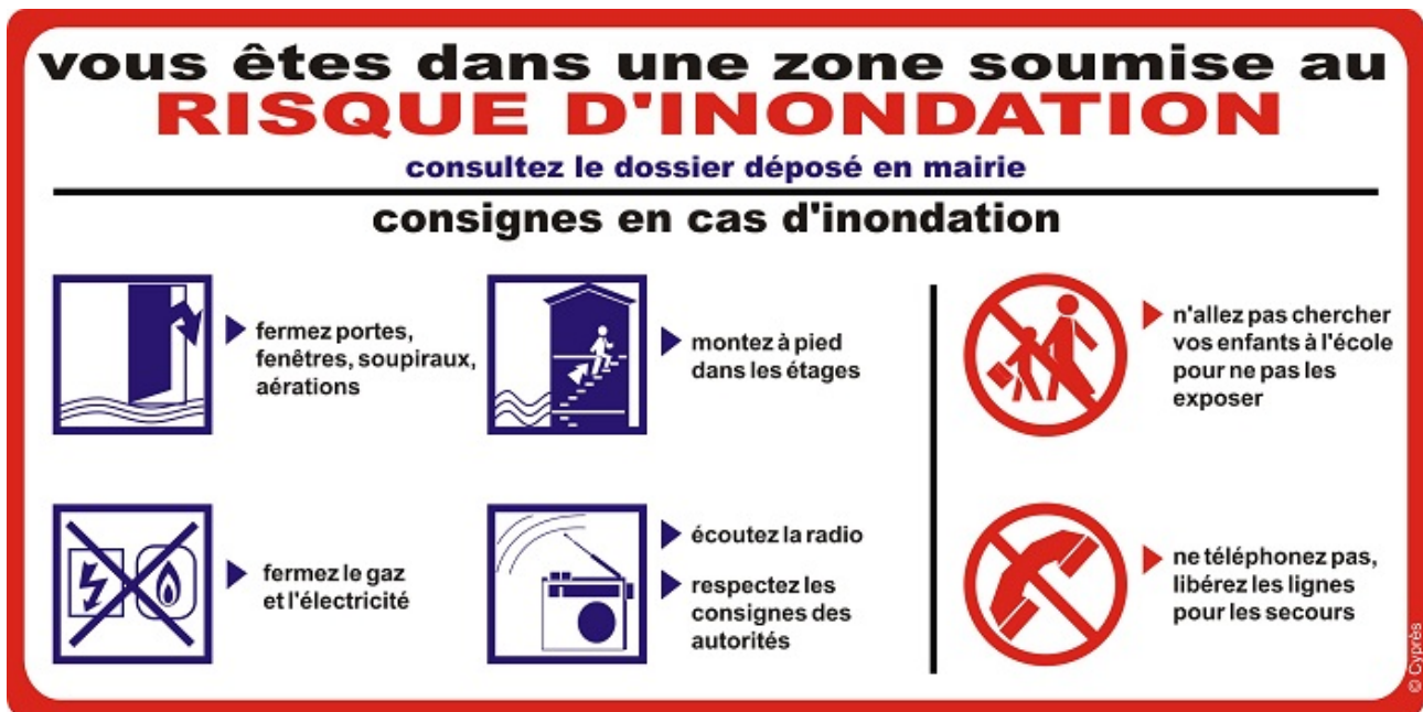
Figure 3. Behavior guidelines 27 .

On this basis, it is important to remember at least two general points. First, a meaningful discourse requires a good narrative construction and structure to engage stakeholders. If the latter does not respect certain rules (current situation, reason why it has happened, steps to follow, positive or negative effects), the meaning of the message will be difficult to understand, identify, and memorize. This communication requires the use of a clear and explicit conventional narrative pattern , first in both its in-depth structure (content organization: series of phases and events) and its discursive and figurative implementation (mapping, graphic design, and how this content is represented).