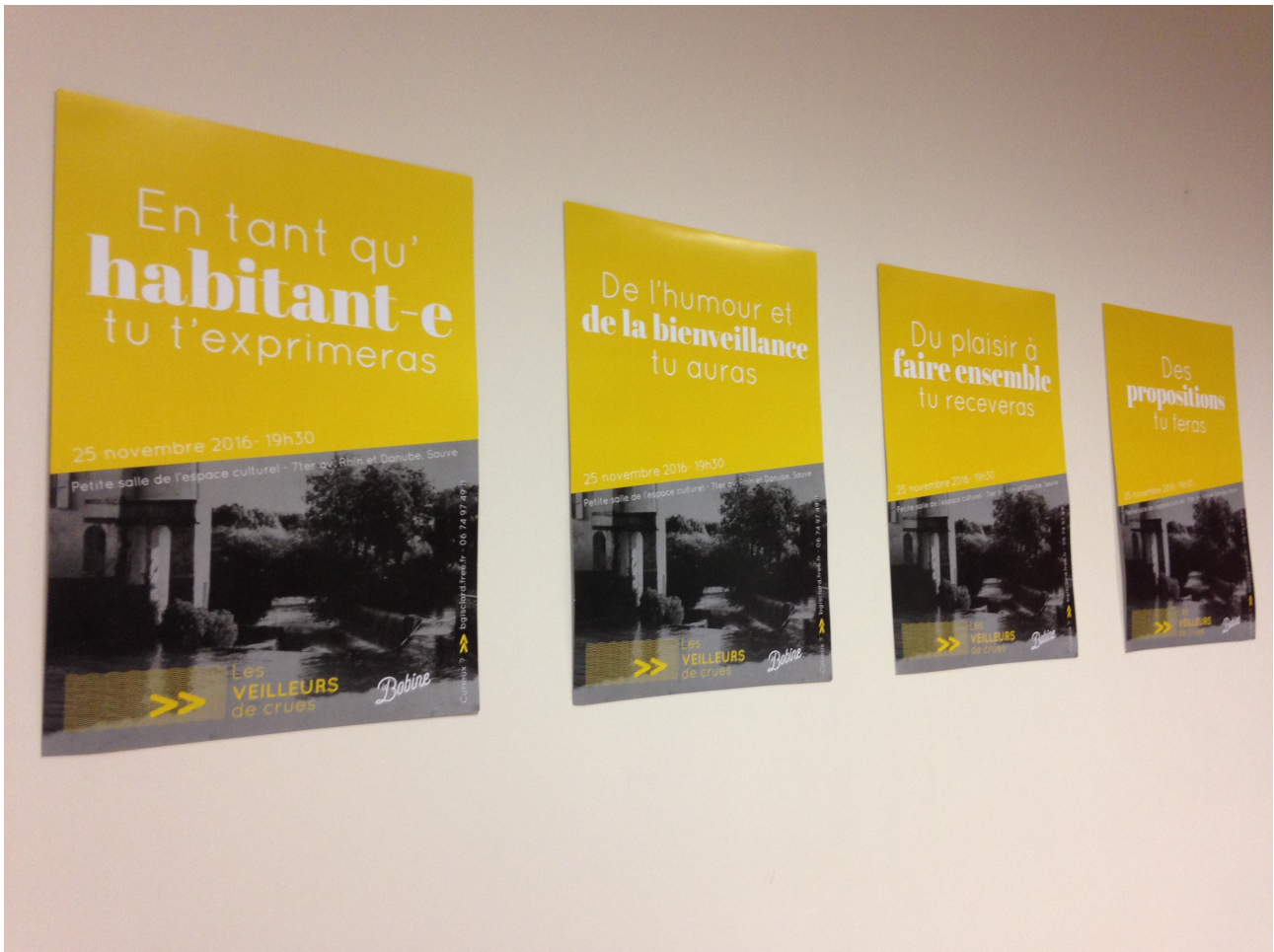
Figure 7. Flood Watchers posters

available network, etc.). This activity allowed participants to engage in roleplay in different flood contexts and come up with different proposals. Although the flood scenario was set in the future, these cards gave a realistic framework for action, without restricting participants' imagination. Participants then had to explain their movements and behavior with various tools. Two teams had access to local maps: an aerial view and a SCAN 25@IGN map 30 . The other two teams only had blank sheets of paper. We had observed that maps of the area play an important role in risk management. Flood risk areas were therefore deliberately hidden, and participants had to identify them according to their recollection of past floods. At the end of the session, each team selected a spokesperson to create a video diary for the other participants. The groups selected the best proposal, and a Flood Watchers certificate was awarded to each participant at the end of the workshop. Particular attention was paid to communication materials (Fig.7).